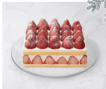
Fraisier Premium VND1,500,000 (reservation at least 24 hours in advance)