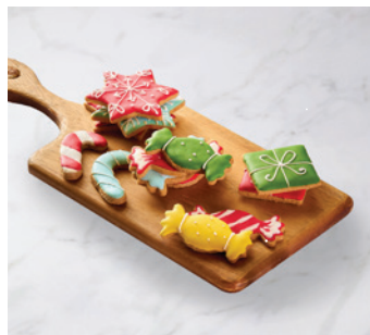
Christmas Cookie VND180,000