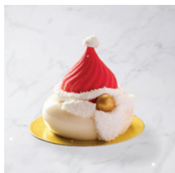
Strawberry Chocolate Mousse VND115,000