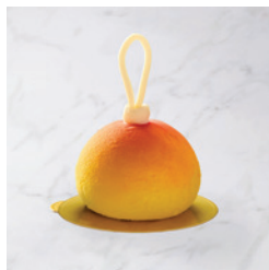
Passion Fruit Bell Mousse VND115,000