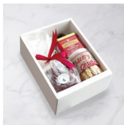
Merrily Set* VND750,000