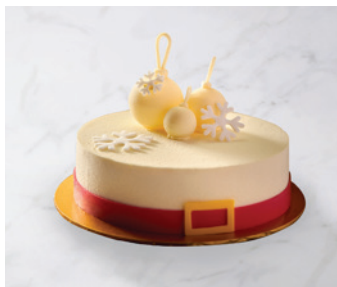
Chocolate Mousse VND899,000