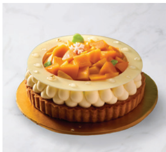
Mango Tart VND750,000