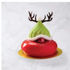
Pitaschio Chocolate Mousse VND115,000