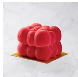
Strawberry Bubble Cake VND150,000