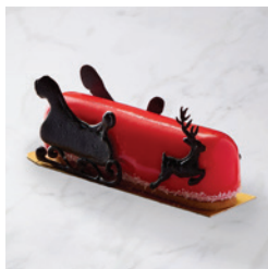
Christmas Éclair VND115,000