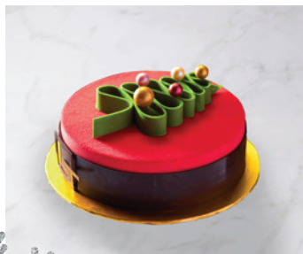
Yogurt Mousse VND899,000