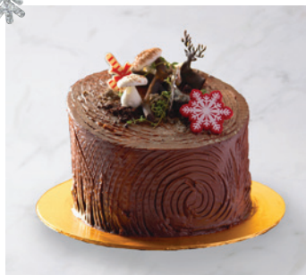
Christmas Chocolate Log Cake VND750,000